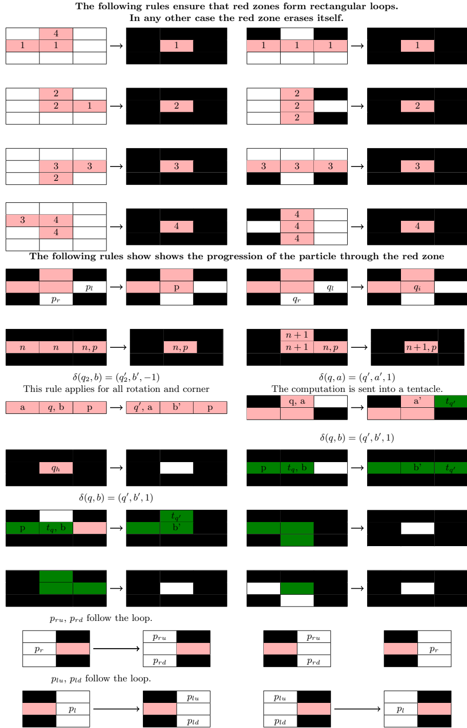
Fig. 3. Main rules for the transition function of the 2 dimensional cellular automaton G_e . Black cells act as wildcards and can match any state in the neighborhood.